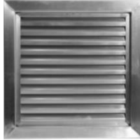
800A1 in Optional Stainless Steel Finish

Inverted "Y" Blades Recommended for Schools, Class "A" and Institutional Buildings.